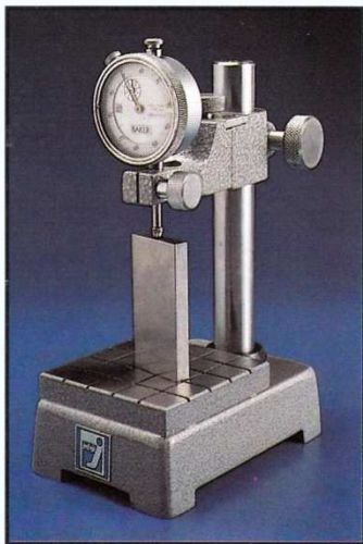
1140 Comparator Stand