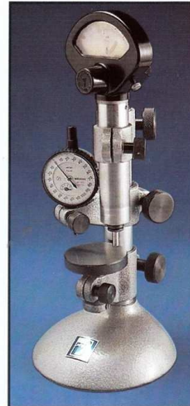
1090 Mykroktor Stand

'JAFUJI' Dial indicator stands are extremely rugged and universally adjustable to any position, these gauges are well suited to inspection, checking and line-up operations anywhere in the shop. All settings are individually made without disturbing others. Quick height positioning of the indicator in a vertical plane is possible by knurled thumb knob.