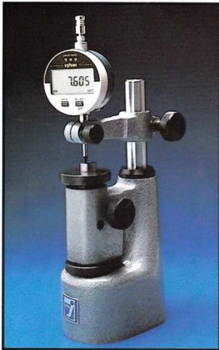
1060 Watch Maker's Mini Dial Indicator Stand